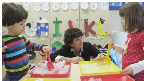
“Create Opportunities to Build on Reading” (approx. 4 min)