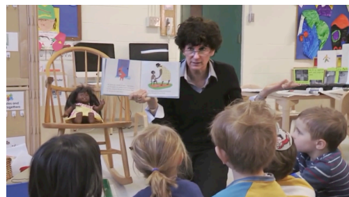
"Teach Through Books and Conversation"